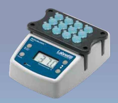
Mini Dry Bath 5.5 x 4.8 x 2.4 in $218