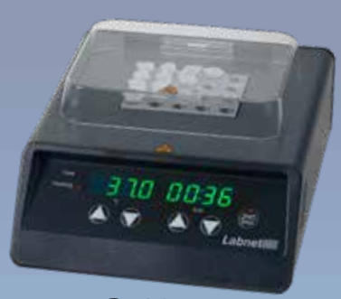
D1301 8.3 x 12.4 x 4.7 in $283