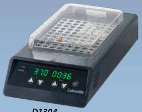
D1304 8.3 x 16.3 x 4.7 in $538