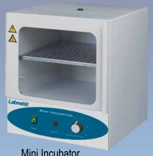
Mini Incubator 11 x 11 x 3.2 in $314