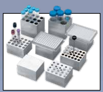
Save 20% on blocks